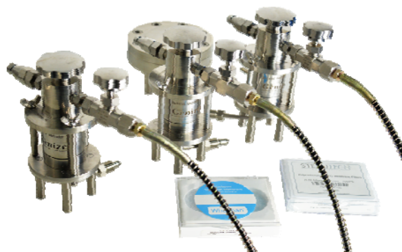
10ml Jacketed Liposome Extruder with Track-Etched Membrane